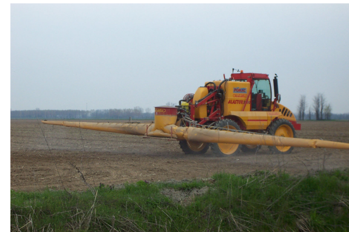
Figure 2: Pesticide application in Cavenago