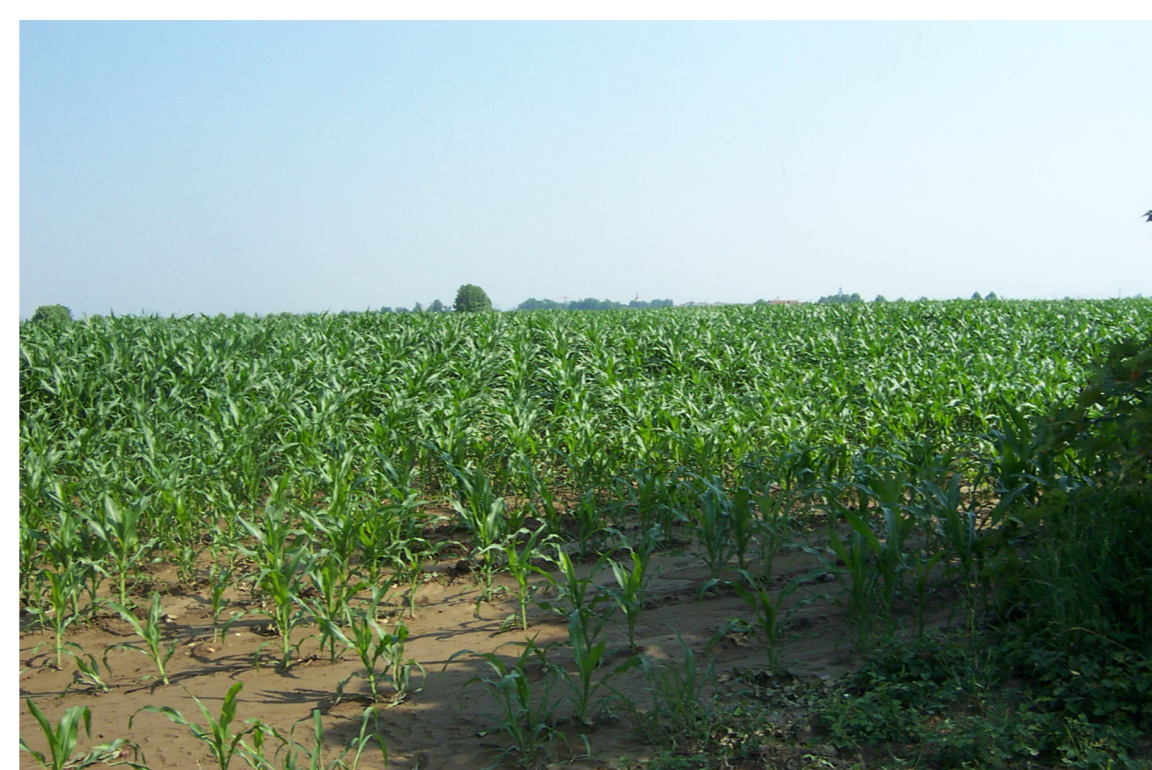
Figure 3: Border irrigation in Martinengo