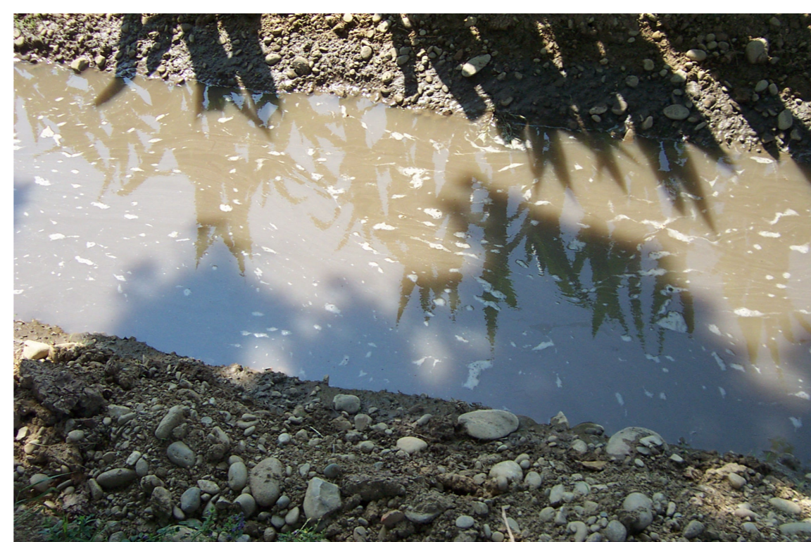
Figure 4: Border irrigation in Martinengo