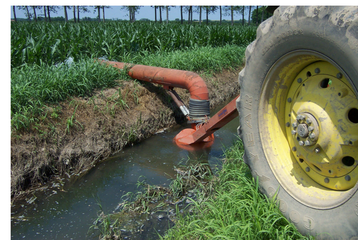
Figure 1: Border irrigation in Cavenago

Two models with different hydrological approach were used to simulate the fate of two herbicides and their metabolites in experimental fields: PELMO 3.22 (with FOCUSPELMO shell 3.2.2) which has the ability to simulate multiple metabolites of one parent compound and MACRO 5.0 model able to simulate preferential flow of water and solute. In PELMO the irrigation water was added to the climatic file. Two years of warming up the models were applied. Terbutylazine and one of its metabolites (DET) content in groundwater under the field (groundwater depth: Martinengo 4±1m, Cavenago 5.5±1.5m) were analysed and compared with the modelling results.